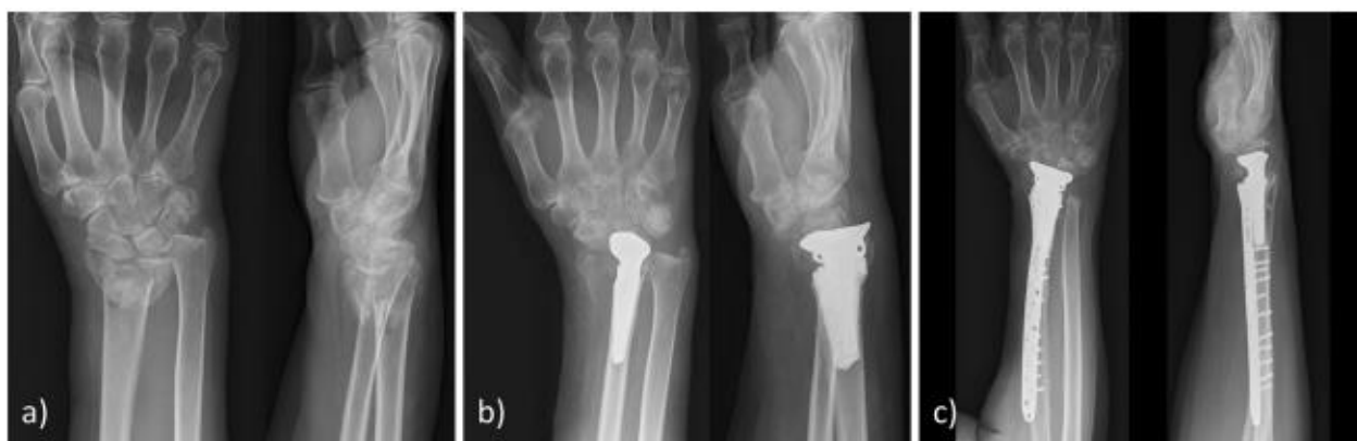
Fig 2: A Radiograph of the initial fracture. b Radiocarpal dislocation after hemiarthroplasty from a palmar approach. Revision included derotational osteotomy with a Darrach procedure and a pronator quadratus interposition transfer. c Radiograph at the follow-up 16 months after revision