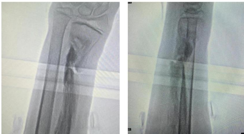
At 6 months complete bone healing was seen.

Case 3 : Chronic osteomyelitis of Distal third shaft of radius 17 year old male with swelling and discharging sinus from the right forearm since 9 months