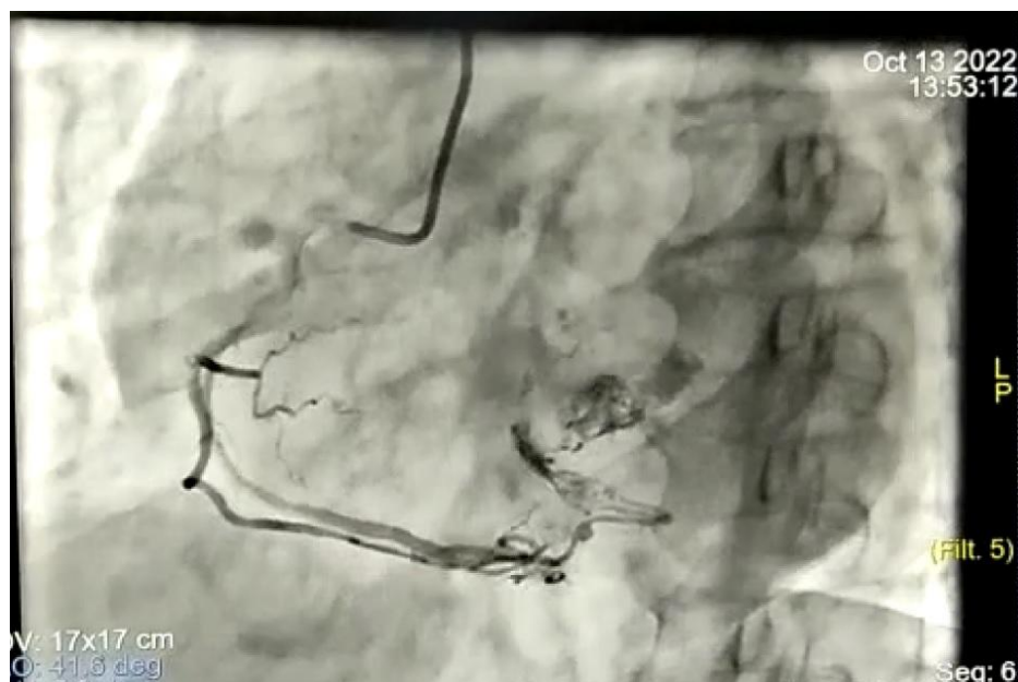
Figure 2: Coronary angiography demonstrating vascular supply to left atrial myxoma from right coronary artery branch.

Coronary angiography revealed mild coronary artery disease. Interestingly, vascular supply to the left atrial myxoma was visualized arising from a branch of the right coronary artery. This finding supported the diagnosis of a vascular cardiac tumor and aided preoperative planning.