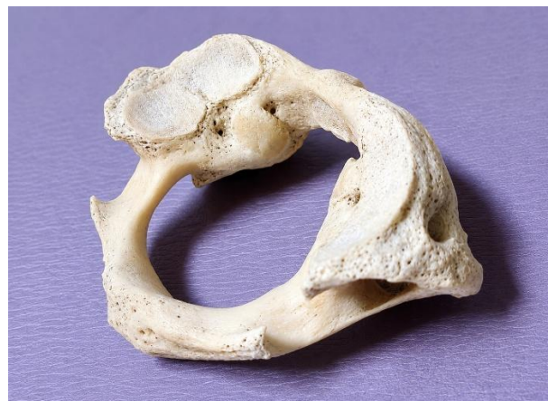
Figure 6: Bilateral Incomplete Arcuate Foramina of the Atlas Vertebra