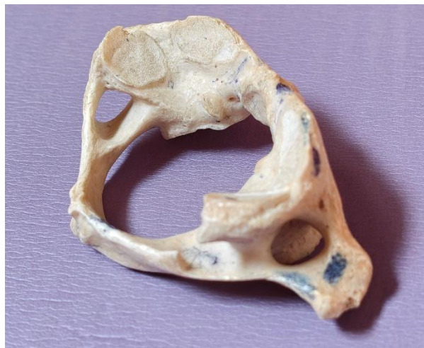
Figure 2: Complete Arcuate Foramen on the Left Side of the Atlas Vertebra