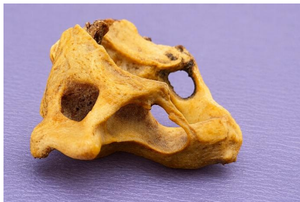
Figure 3: Bilateral Complete Arcuate Foramina of the Atlas Vertebra