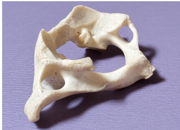
Figure 1: Complete Arcuate Foramen on the Right Side of the Atlas Vertebra