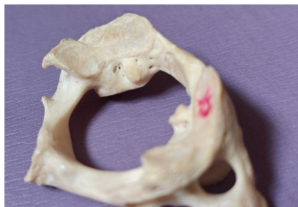
Figure 5: Incomplete Arcuate Foramen on the Left Side of the Atlas Vertebra